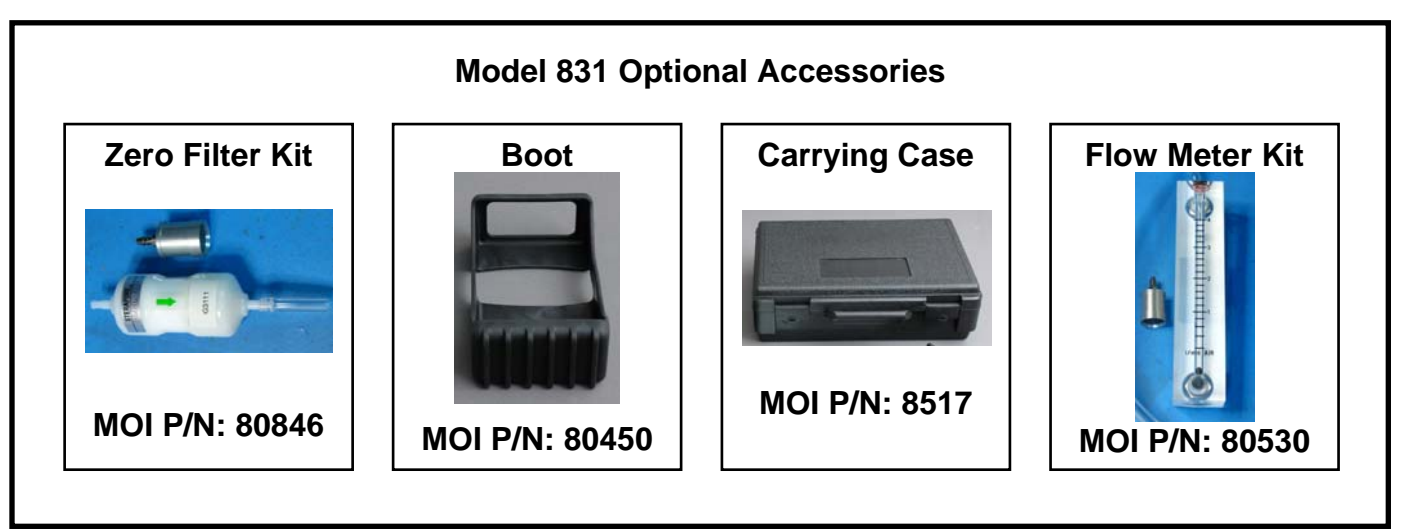
Figure 2 – Optional Accessories