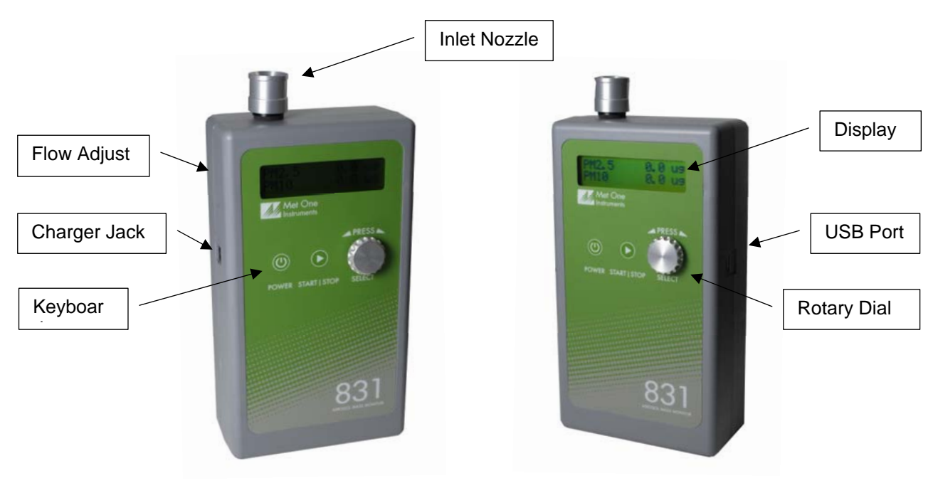
Figure 3 – 831 Layout

The following figure shows the layout of the Model 831 and provides a description of the components.